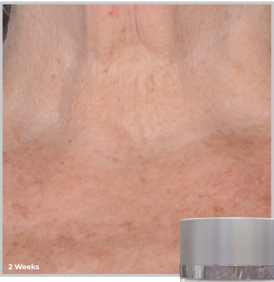
Female, Age 77:

ALASTIN Skincare® Regimen: Patient treated with Restorative Neck Complex twice daily and no procedure was done Imaging Equipment & Analysis: Quantificare LifeViz® Infinity